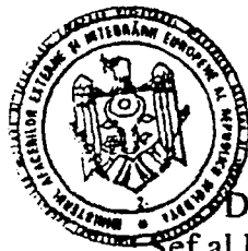
Dumitru SOCOLAN, Șef al Direcției Generale Drept Internațional a Ministerului Afacerilor Externe și Integrării Europene al Republicii Moldova

Prin prezenta confirm că textul alăturat este o copie certificată de pe Acordul de finanțare dintre Republica Moldova și Asociația Internațională pentru Dezvoltare privind finanțarea Proiectului "Modernizarea sectorului sănătății în Republica Moldova" (Chișinău, 11 iulie 2014), originalul căruia este depozitat la Arhiva Tratatelor a Ministerului Afacerilor Externe și Integrării Europene.